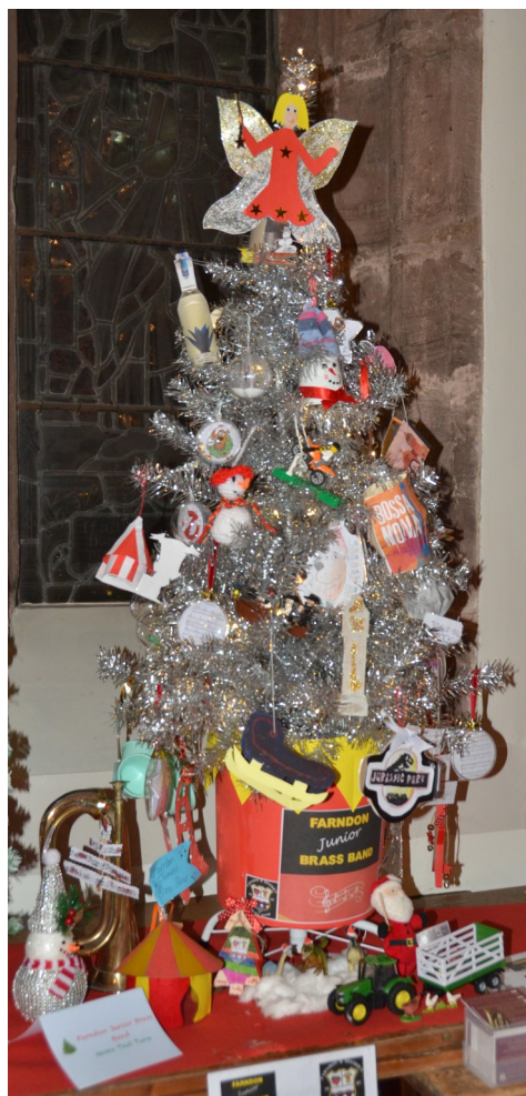
Above. Farndon Junior Brass Band offering at this year's tree festival. Below and right the band playing in St.Chad's church and later at the tree in the middle of the village.